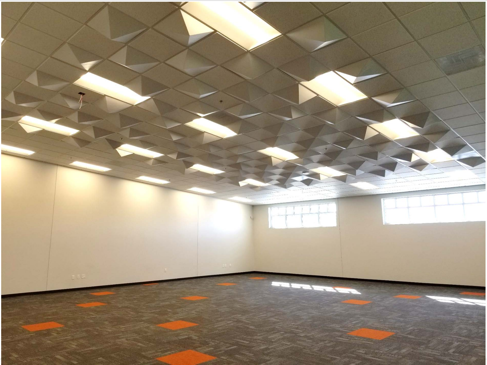
Band classroom with acoustic ceiling installed