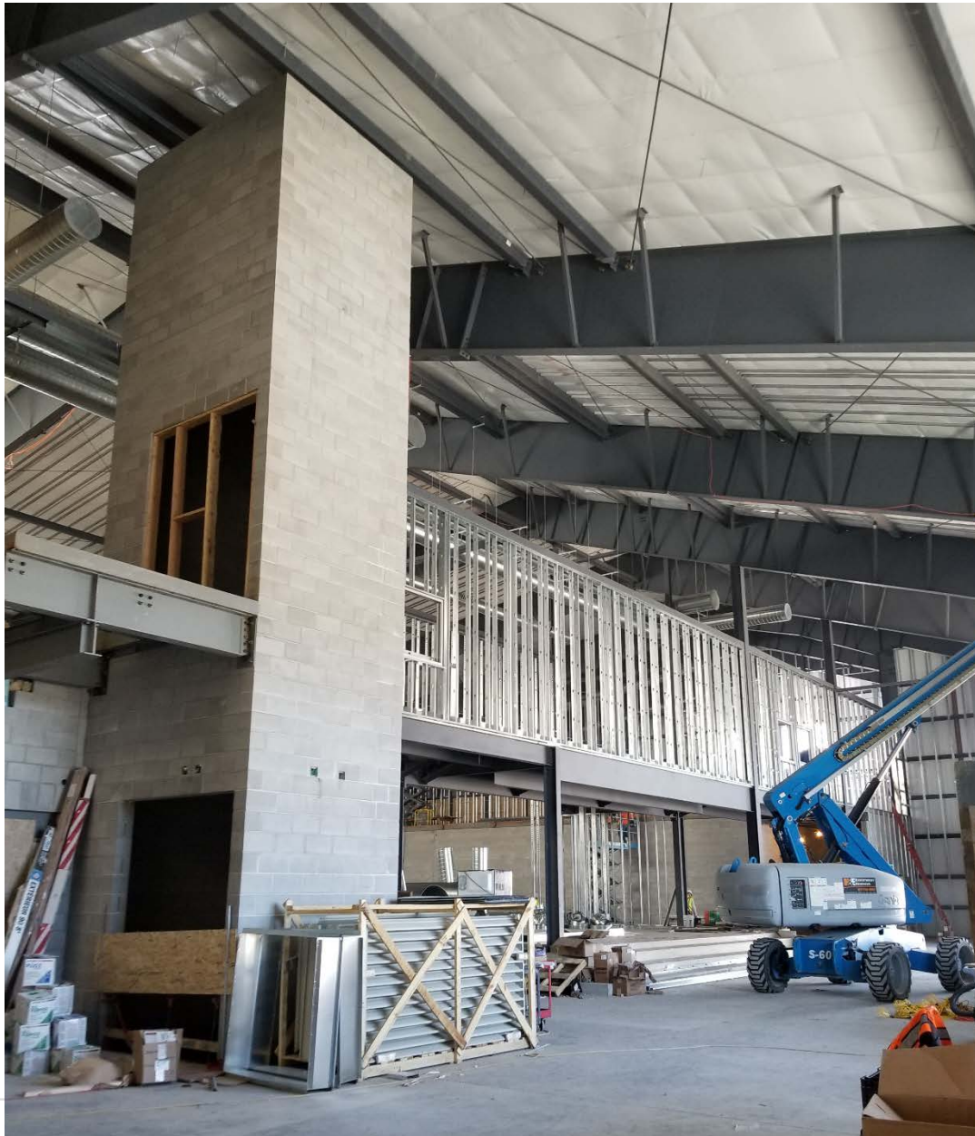
Elevator and stage beyond